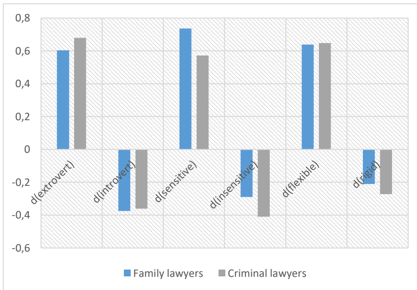
Figure 1: Average results of Personality Traits – Anti-Traits in each group of lawyers.

Finally, the levels obtained using the neurosophic operator dT_{trait\&Antitrait} (average) are compared with the values of \epsilon and \Theta set by the experts (see Figure 2).