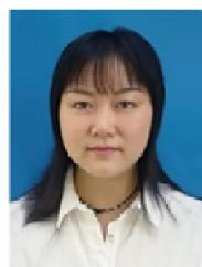
group decision making and intuitionistic fuzzy sets analysis.