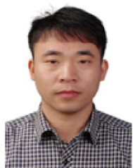
intelligent computing and uncertain information fusion.