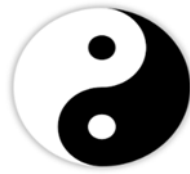
Fig 1. Ying and Yang

It is also the Classical or Boolean Logic , which has two symbol-values: truth T and falsity F .