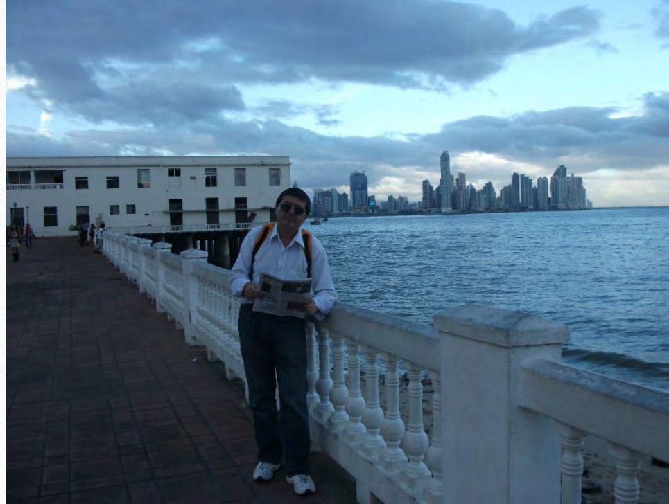
Florentin Smarandache in Panama City, January 2011