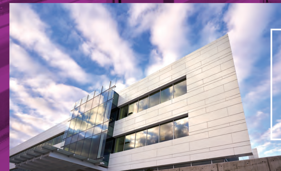
Farris Engineering Center 2014 Legislative Session