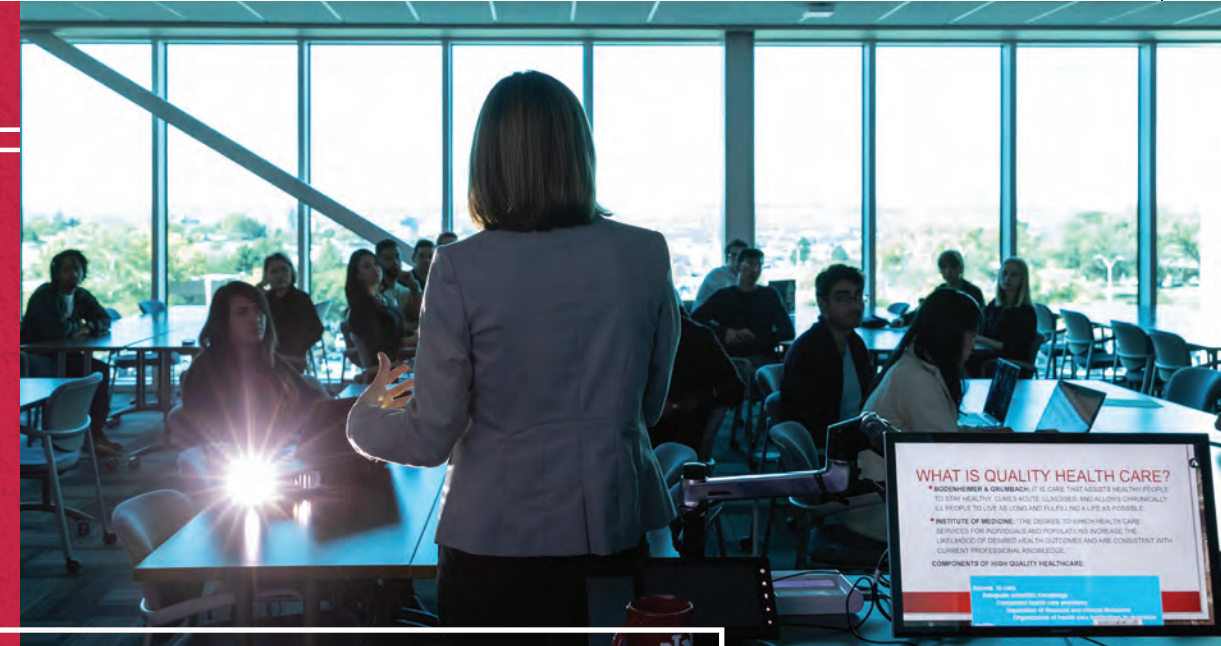
Domenici Center for Health Sciences Education 2014 Legislative Session

UNM supports the state's three higher education associations' request for 5% compensation based on new compensation calculation. This request will reflect the hard work and dedication of our faculty and staff.